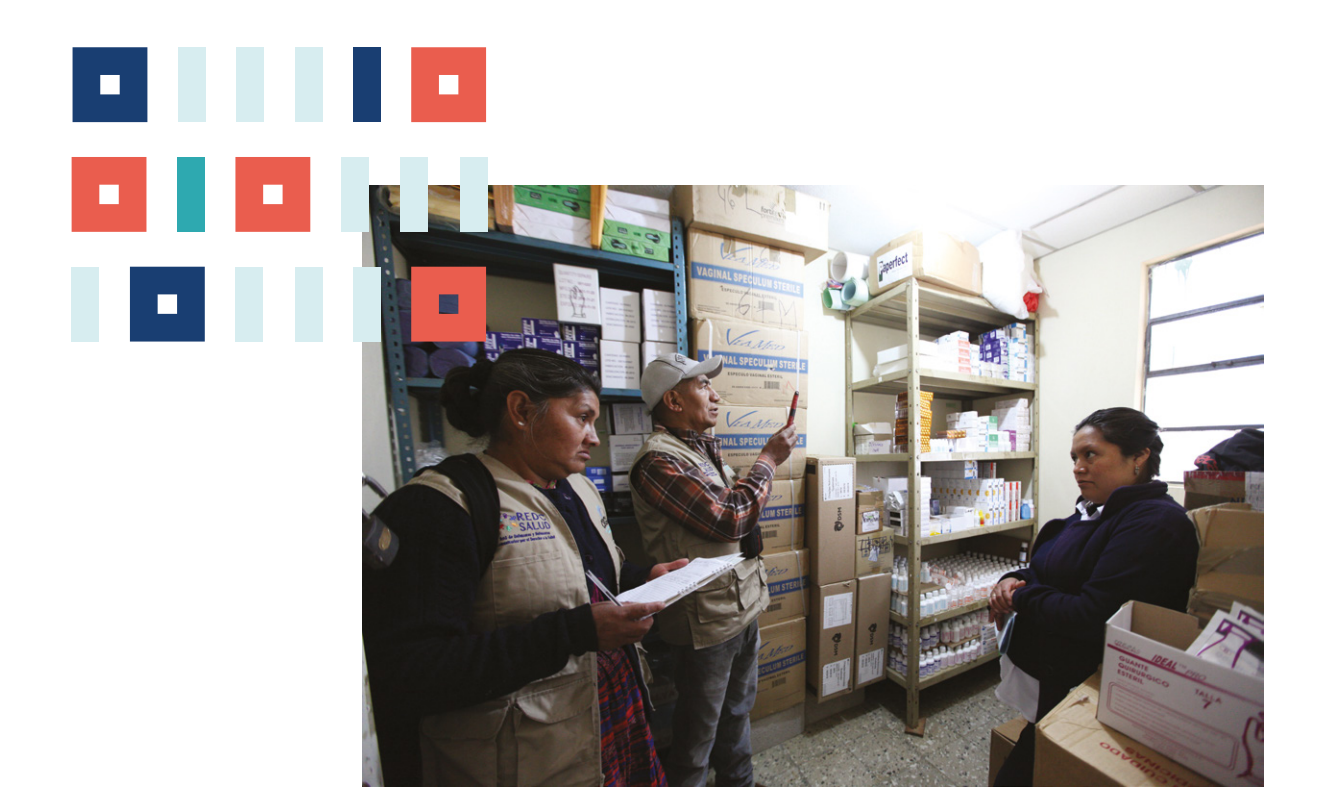
Community leaders interview providers in rural healthcare facilities in Totonicapan and Sololá provinces, Guatemala.

For those community partners who play a participatory or peer research role, or who are actively involved in recruiting further participants, you may wish to think about how you can formally contract them (and pay them) as part of the local research team. For other issues of compensation, it depends on the specific cultural context in which you are working (in some instances, direct payment may be considered disrespectful and can create unintended tensions at local level). Thus, it is important to have a consultative process in the initial stages of the engagement to work out what constitutes meaningful forms of reciprocity that researchers can offer as part of a time-bound project [11]. Specific to the question of financial reimbursement, NIHR offers the following guidance.